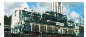
Processing (Meat, fruit, vegetables, trees, etc.)