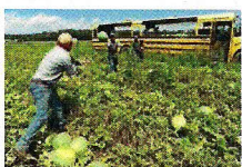
Harvest (fruit and vegetables)