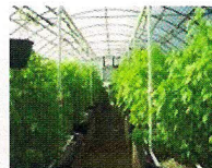
Nursery, Sod, Greenhouse